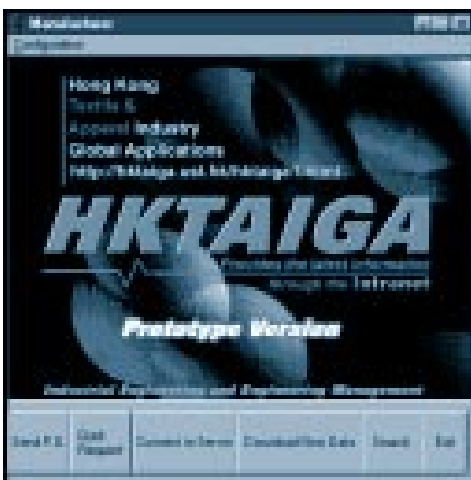
Figure 4 Interactive Decision Support Systems. Some of the related systems on top of the information technology infrastructure for textile and apparel industry Hong Kong